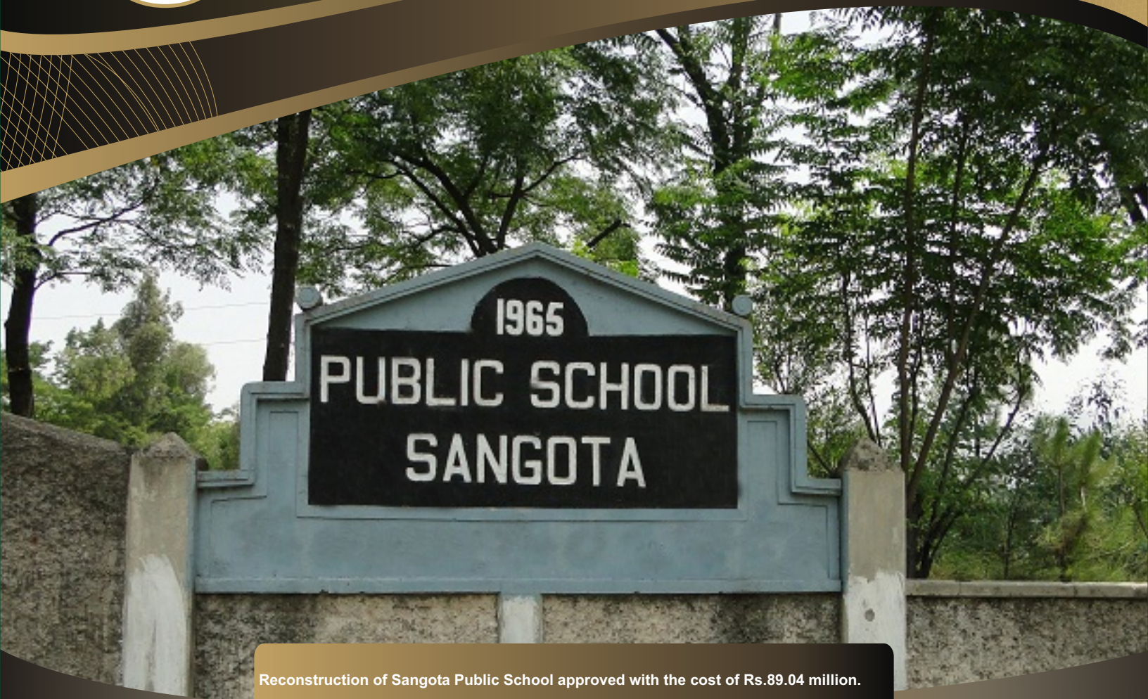
Reconstruction of Sangota Public School approved with the cost of Rs.89.04 million.